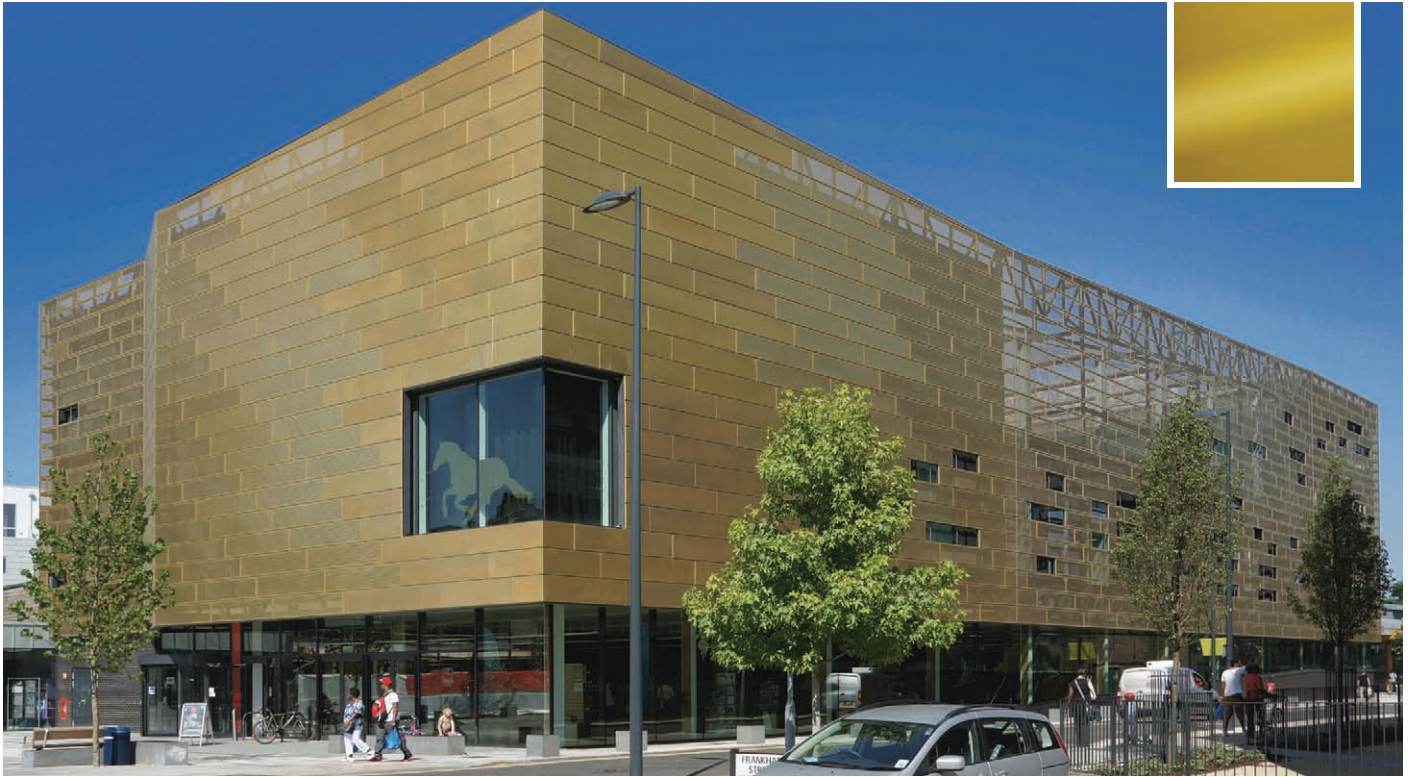
Deptford Lounge, London; Architects: Pollard Thomas Edwards architects.