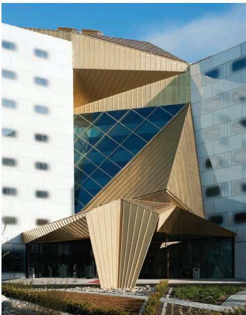
Clarion Hotel, Trondheim, Norway; Architects: Space Group.

Nordic Royal™ is an alloy of copper with aluminium and zinc, giving it a rich golden through-colour and making it very stable. It has a thin protective oxide layer containing all three alloy elements when produced. As a result, the surface retains its golden colour and simply loses some of its sheen as the oxide layer thickens with exposure to the atmosphere to give a matt finish. It behaves differently to other Aurubis copper products over time and does not develop a blue or green patina.