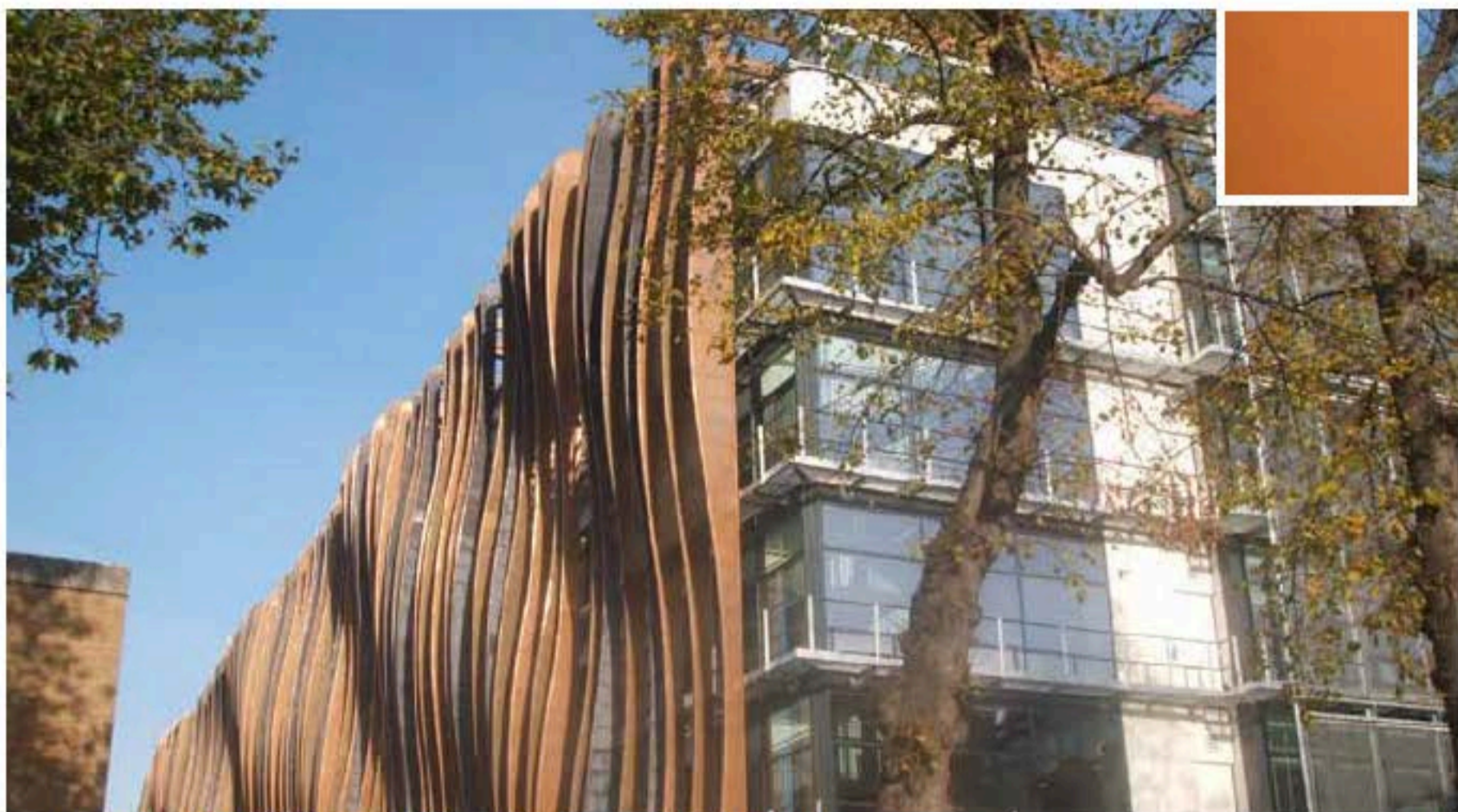
Vertical solar shading fins, each clad in either Nordic Bronze, Nordic Brass or Nordic Brown™. Holland Park School, London; Architects: Aedas.