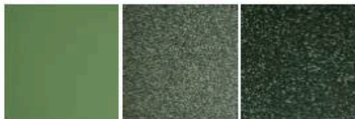
Nordic Green™ Traditional

By its nature, Aurubis' pre-patination process encourages the continuing formation of natural patina by releasing copper sulphate to react with the copper below. So, just like natural patina, Nordic Green™ undergoes continuous changes through environmental exposure dependant upon local atmospheric and rainfall condition.