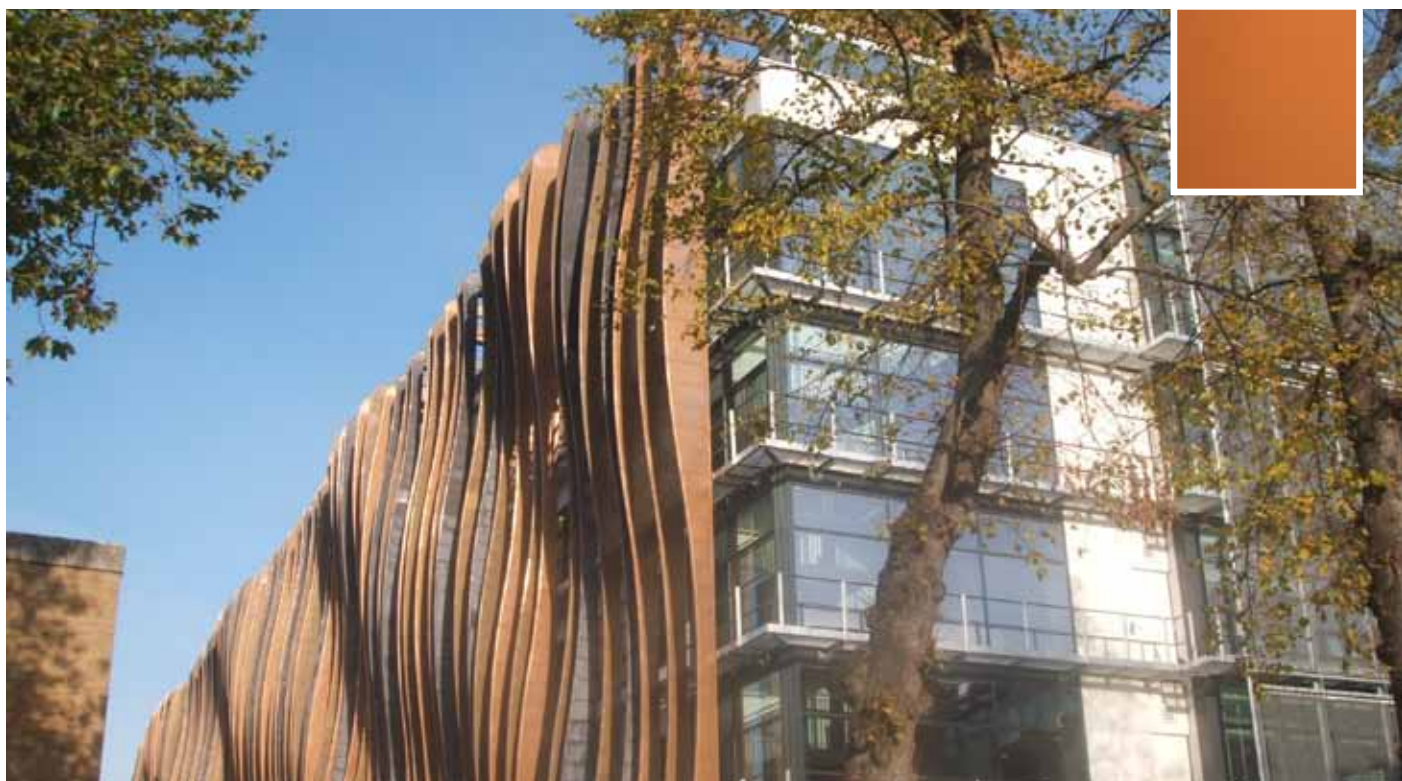
Vertical solar shading fins, each clad in either Nordic Bronze, Nordic Brass or Nordic Brown™. Holland Park School, London; Architects: Aedas.