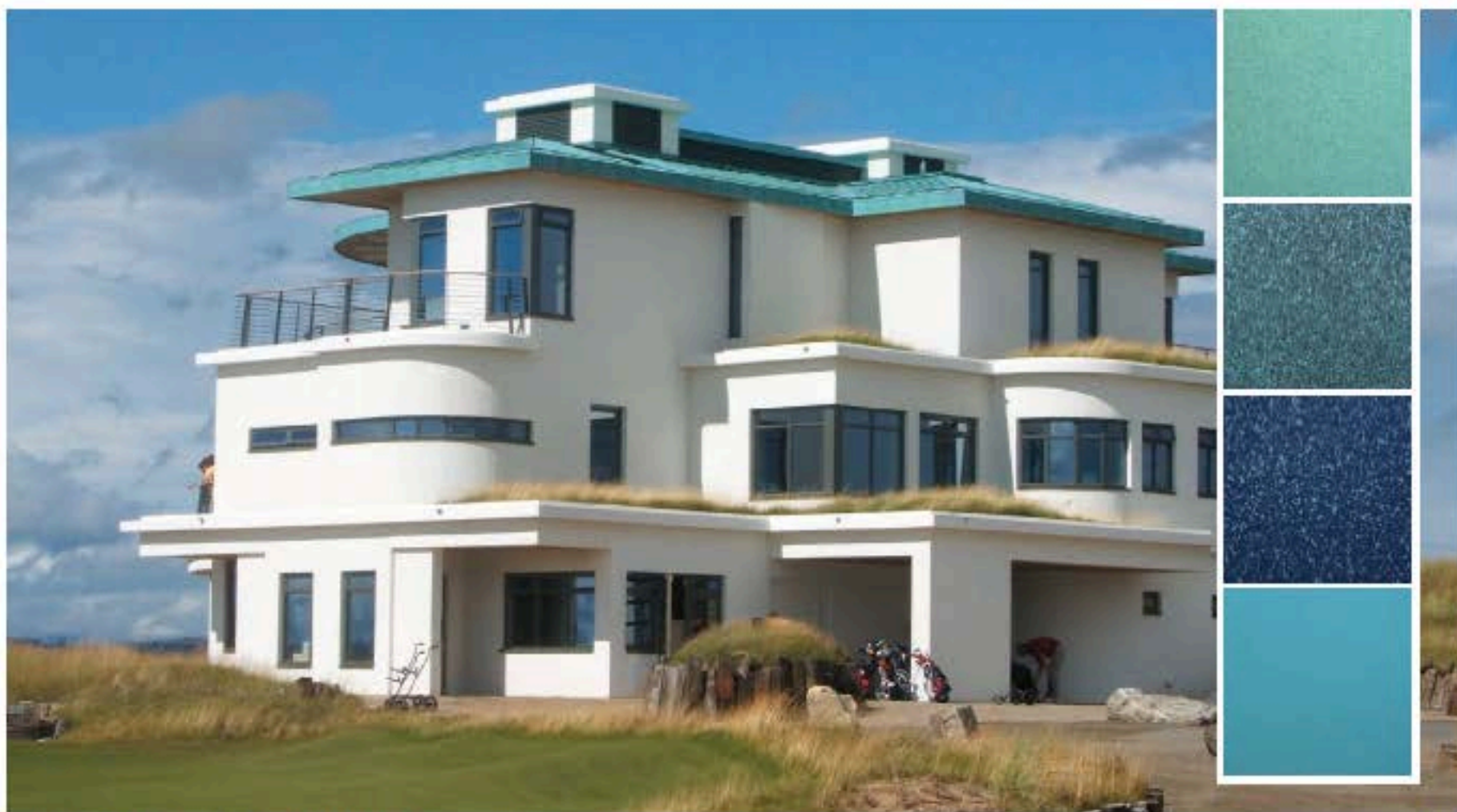
Castle Stuart Golf Links Clubhouse, Scotland; Architects: G+A Architects.