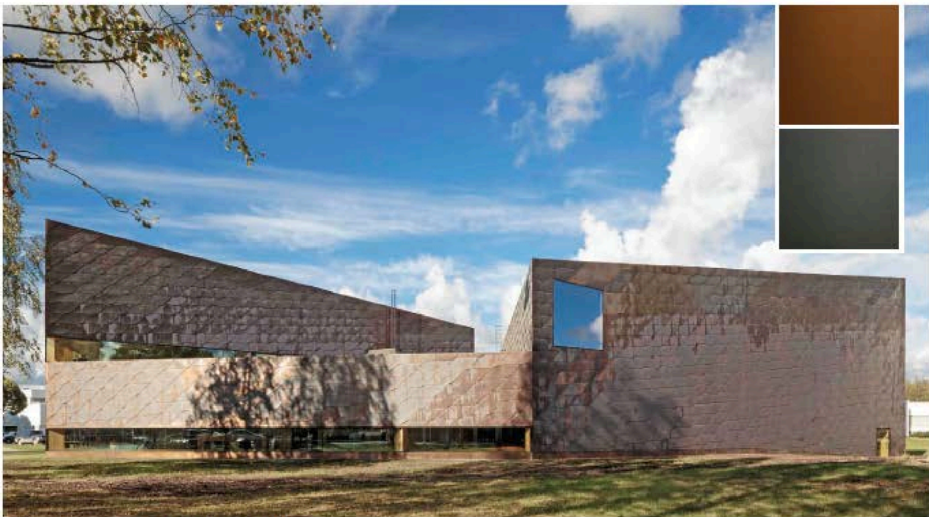
Aalto Centre Library extension, Seinäjoki, Finland; Architects: JKMM.