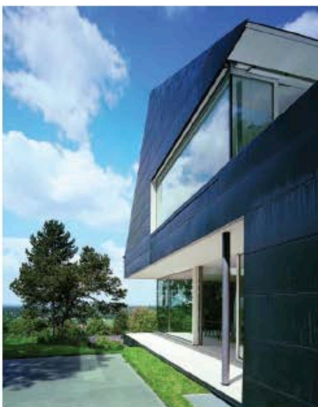
House in Seeheim, Germany; Architects: Fritsch und Schlüter Architekten.

It can also be provided in a wide range of different forms and used in various systems.